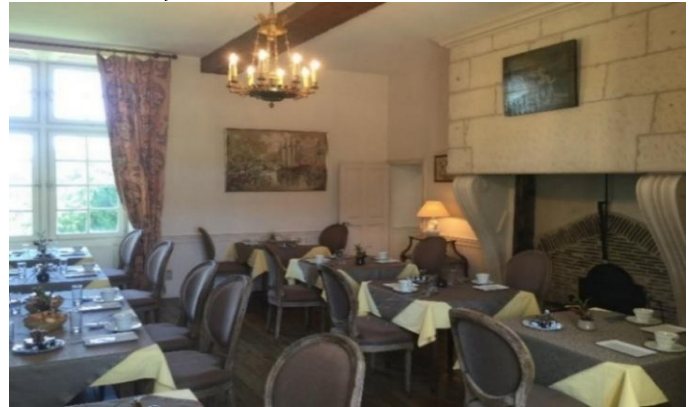
The Evêque room 45m 2 / 30 people seated