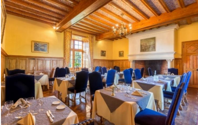
The wooded room 50m 2 / 35 people seated