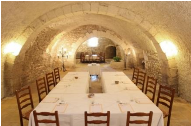
The Voûtée room 100m 2 / 30 to 70 people